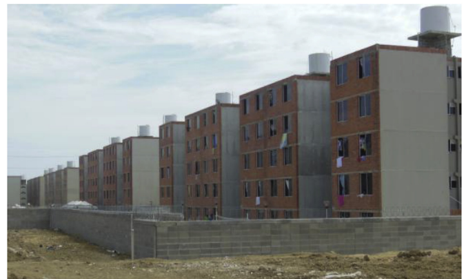
Picture 5. Las Gardenias Free Housing project in Barranquilla.

From the three potential types of interventions for the IDPs—facilitating return, providing new housing, and improving existing housing—only the two former are tried in Colombia, with little success. While the Land Restitution program has failed to bring masses of IDPs back to rural areas, the Free Housing program has resulted in the relocation of thousands of the displaced families within the same city and placing them in new housing projects,