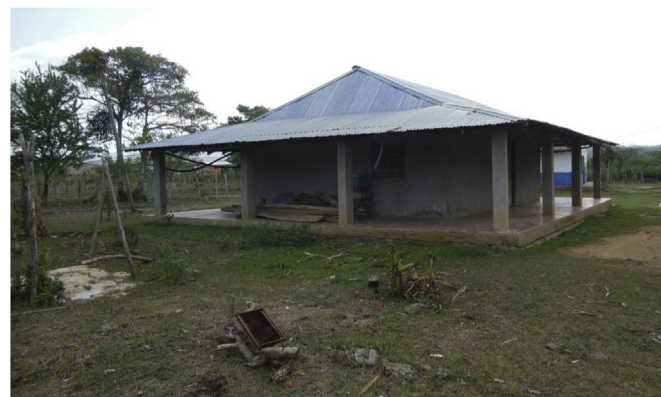
Picture 3. Vacant farm in El Carmen de Bolívar. It was restituted to the original owner, but he did not want to return there and take up farming again.

produce their own food. For this reason, two respondents said they would consider moving to the countryside—not to the same area where they came from, but somewhere else.