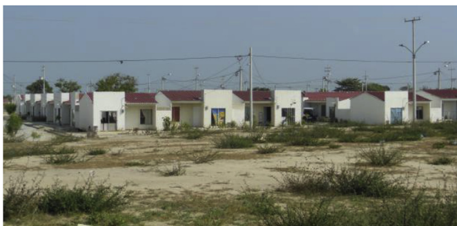
Picture 2. Nueva Esperanza housing project.