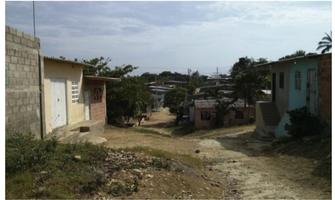
Picture 4. Siete de Abril is one of many informal settlements in Barranquilla inhabited largely by IDPs.

Insecurity might become a growing problem in the new Free Housing projects in the future, as an increasing number of crime, activity of local street gangs, acts of vandalism, stealing and