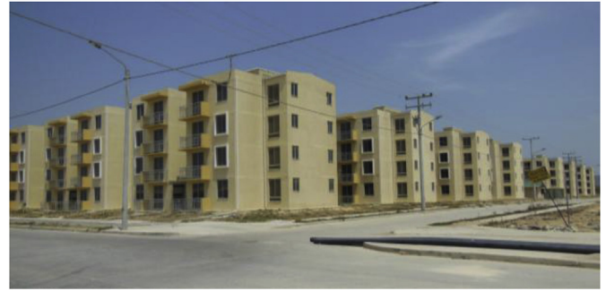
Picture 1. Villas de San Pablo housing project.